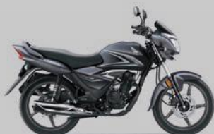
GENY GREY METALLIC