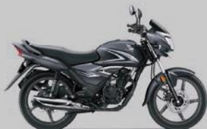
MATTE AXIS GREY