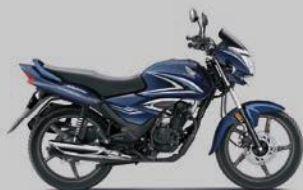
DECENT BLUE METALLIC